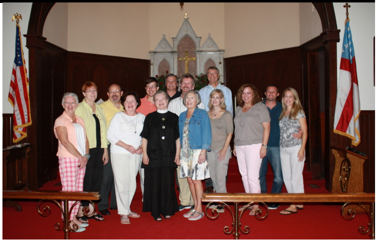
The twenty members of the tornado relief team from the Church of the Incarnation, Dallas, and the Church of the Good Shepherd, Terrell (both Diocese of Dallas) were with us in worship on Sunday, September 3, after spending four days doing demolition in Joplin.

A reminder that the diocesan “free garage sale” at St. Philip's Church in Joplin will be Saturday, October 22. Items needed will include winter clothing, furniture, household items, small appliances, linens, electric space heaters, and holiday supplies. Help needed all that week! We have a rental storage unit here in Carthage which can hold some items until then. PLEASE call ahead to make sure we can be there to put it in the unit rather than simply showing up with items. There will be signup sheets for work Friday night in Joplin to assist with the ministry!